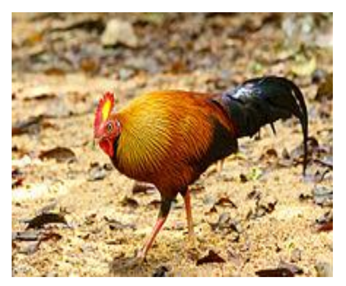
Figure 5: Jungle fowl (Gallus lafayettii)