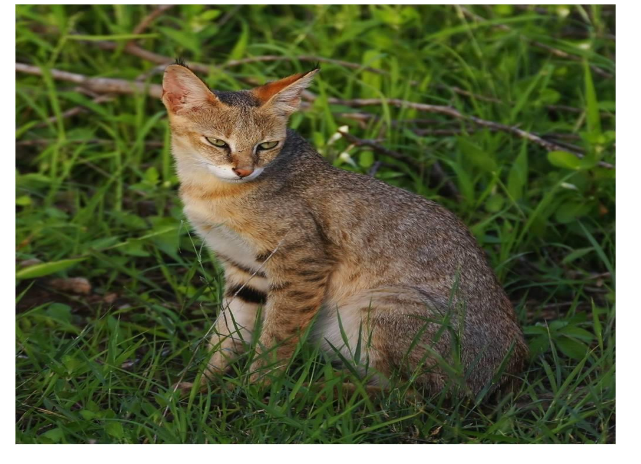
Figure 4: Jungle cat ( Felis chaus )

flora of local wildlife [2]. In our study there were two E. coli isolates from wild animals which showed multi resistance (resistance to more than 6 antimicrobials). These species were Jungle Cat ( Felis chaus , Fig. 4) and Jungle Fowl ( Gallus lafayetti . Fig. 5), both of which are found close to human habitats and may be frequently feed on domestic animals and their wastes.